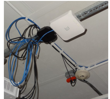
Solar panels, new lights, and upgraded WiFi are a few of the school improvements.