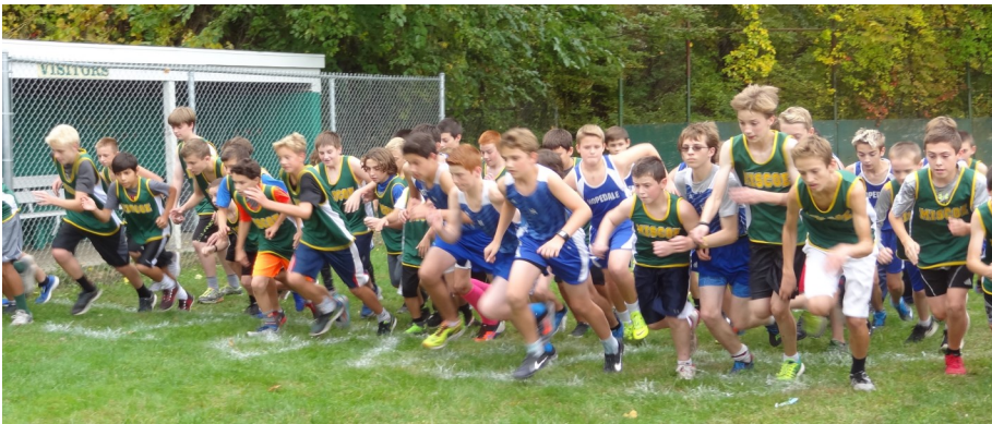
The Cross Country runners in action.