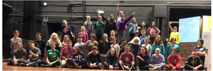
The cast of Fame.